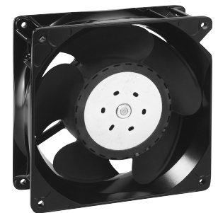
S-Force Series: 5300