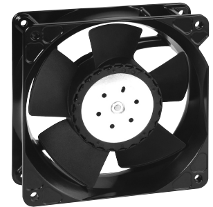
S-Force Series: 4100