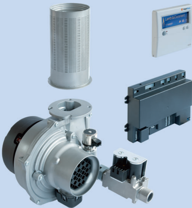
LambdaConstant System: Burner in conjunction with mass flow controlled gas blower and control

The best ideas shine through: As the home base of the LambdaConstant project, ebm-papst Landshut was selected as a landmark in the Land of Ideas for 2010.