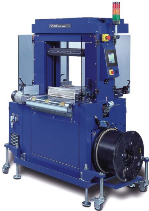
Fig. 1: Thanks to the latest DC drives, “mechatronics” has found its way into modern strapping machines. This avoids the need for mechanical parts that wear, reduces the number of components and thus lowers the follow-up costs of the machine.