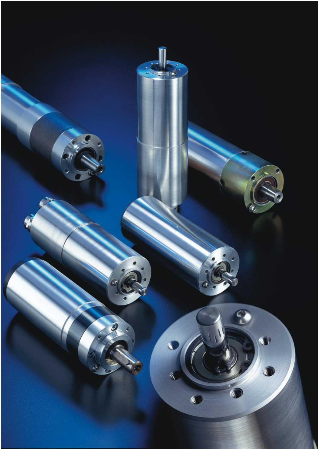
Fig 3: The benefit of electronically commutated motors lies in the high output from small physical dimensions.