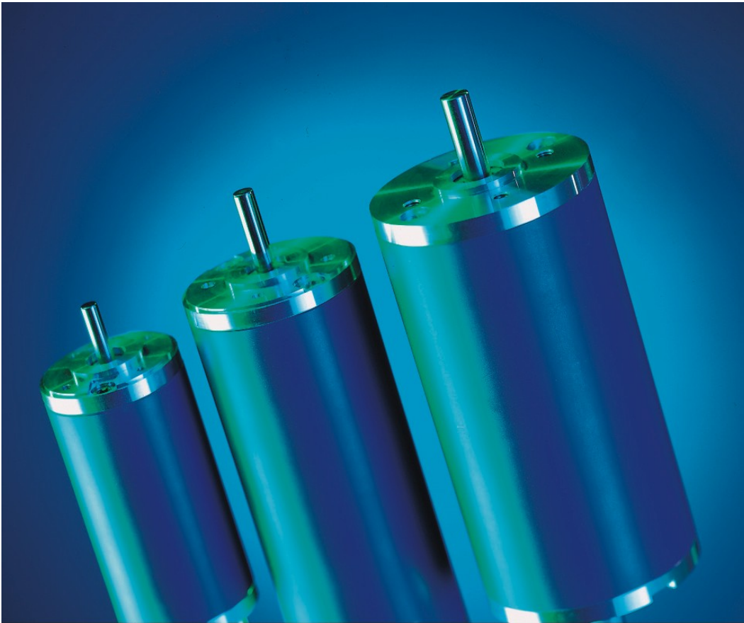
Fig 4: The main benefit of this completely newly designed generation of motors is the excellent performance to cost ratio as well as its long service life.